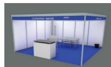
Images show an example of a 16m 2 stand

PLEASE NOTE: THE GRAPHIC REPRESENTATIONS ARE EXAMPLES ONLY