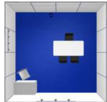
Image shows example of 16m 2 stand