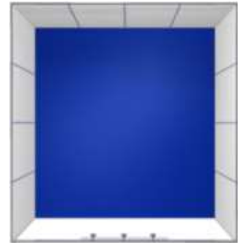
Image shows example of 16m 2 stand